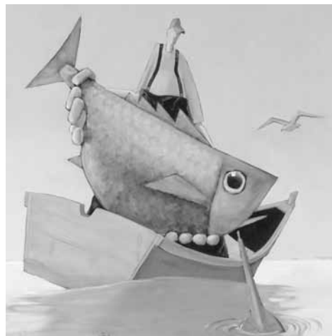
“Amos” by David Witbeck.

Most of the gallery’s sculptures are on display