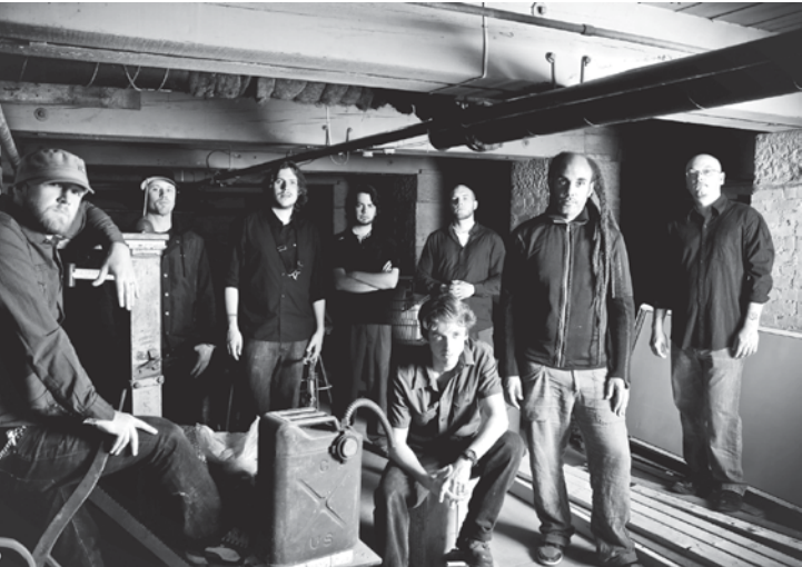
John Brown’s Body.

The Back River Farm site has belonged to the Huggins family for generations. It’s also conserved land, and must be restored to