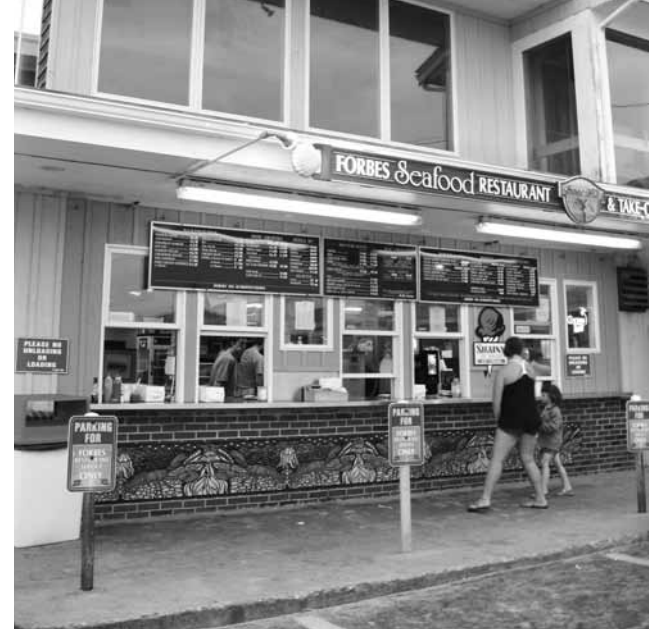
Forbes Seafood Restaurant.

There is also pizza (starting at $15 and $1.40 for each addi-