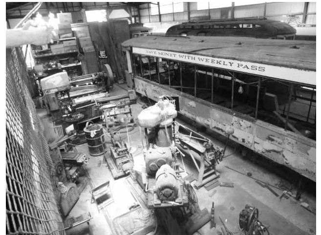
“Where the magic happens,” at the Town House Shop.

Another example is the ornate “City of Manchester” (the