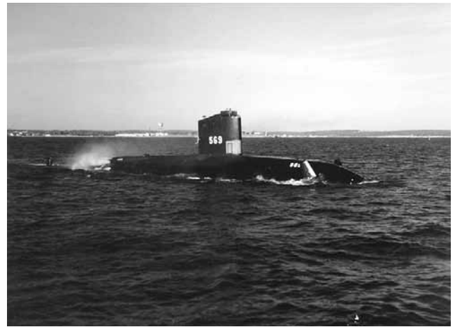
USS Albacore.

On Saturday, Aug. 20, visitors can enjoy the park’s 25th Anniversary Open House from 9:30 a.m. to 5 p.m. with free admission and listen to first-hand crew accounts. Former sailors will be on site to answer questions about their service along with crew members from nuclear subs currently stationed at the Portsmouth Naval Shipyard. The day’s schedule will include plenty of family-friendly activities including a kids’ submarine trivia hunt, and the USS Albacore will be adorned with silver