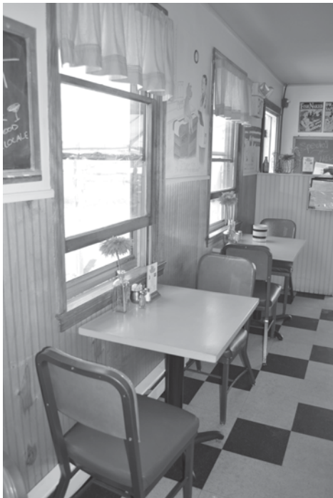
Fresh Local Bayside at Great Bay Marina in Newington.