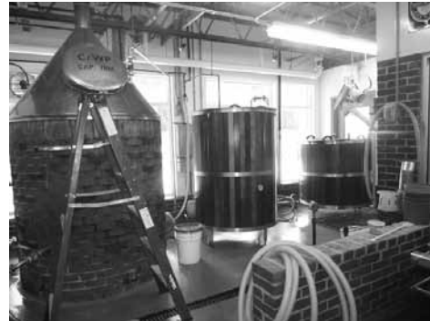
At left, kolding tanks and brick kettle where the wort boils and combines with hops at Kennebunk Brewing Company. Right, wines at Grissini Italian Bistro.

The diversity of beer sold at Tully's is limited only by the imagination. Tully's distributes local microbrewed beers, seasonal brews and craft beers, domestic and imported beers, cider, mead, and even big bottle series, among others. Lucky for visitors, Tully's also hosts monthly themed beer tastings. The store has been offering the free tastings since 2002 and Tully tries hard to offer as many different beers as possible: "Beer is difficult because there are a finite amount that we are willing to offer tastings for. Nevertheless, all but one of our tastings has been label exclusive. The one