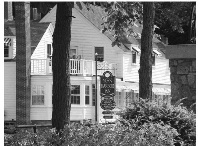
York Harbor Inn.

When his children were young he wrote them songs, and for his wife he wrote a song titled “Living the Dream.” The album of the same name featured the song “The Don” about the 28 people who died during one of Maine’s maritime tragedies. His latest album, Old Hat With A New Coat , is a collection of Americana-influenced